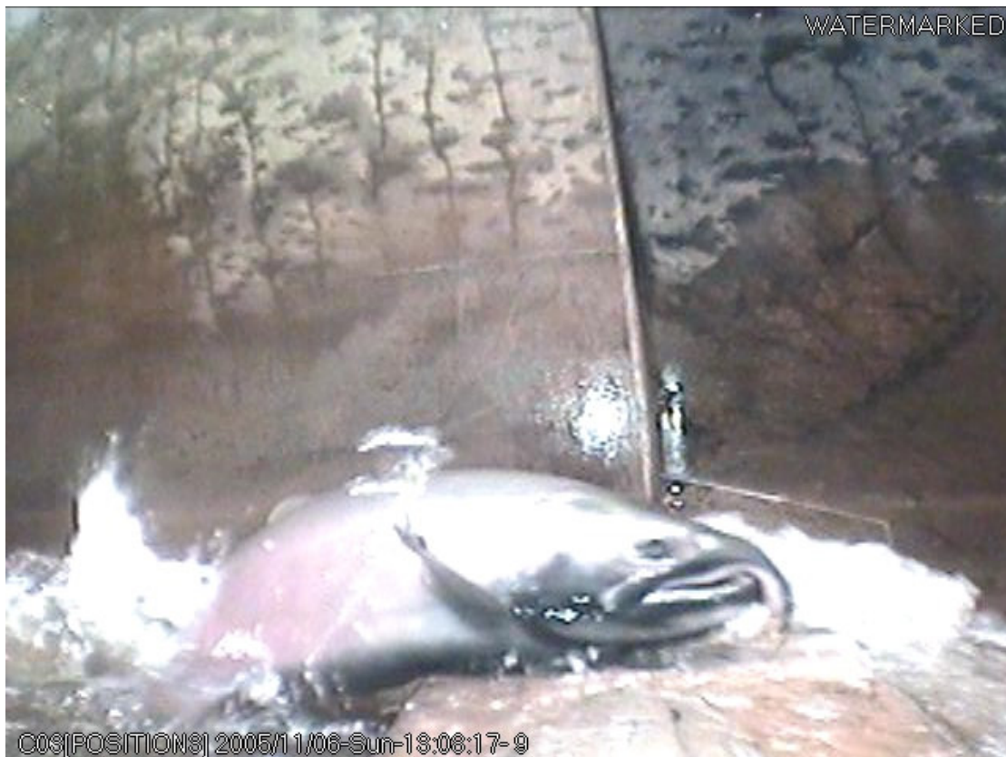
Figure 1. Representative photographs of individual coho passing through the facility during the 2005-2006 season. Additional photographs and movie clips are available upon request.

P.O. Box 402 • Duvall WA 98019 • 425-788-1167 • Fax 425-788-9634 wildfish@washingtontrout.org • www.washingtontrout.org