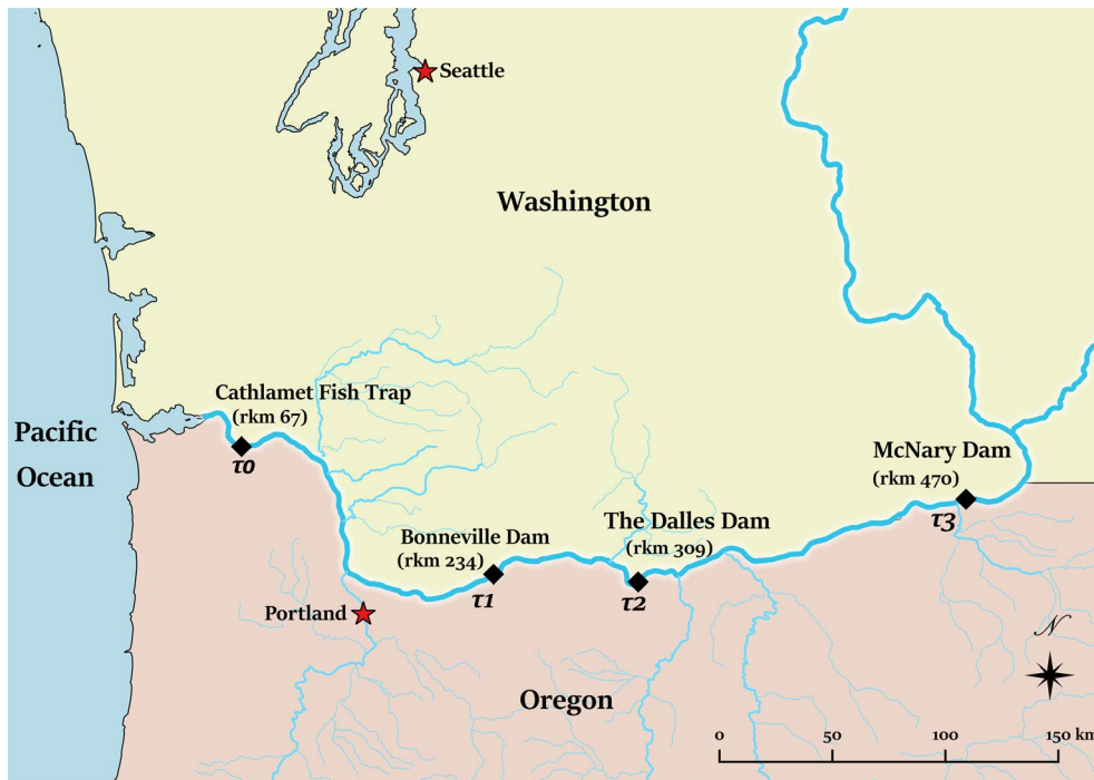
Figure 3. The effect on postrelease survival ( \tau ) was estimated between the capture and release site at the experimental fish trap (river kilometer [rkm] 67) and the PIT tag arrays at upstream detection points: Bonneville Dam (rkm 234), The Dalles Dam (rkm 309), and McNary Dam (rkm 470). The last detection field consisted of all adult PIT tag detectors above McNary Dam.

Generalized linear modeling (GLM) based on a log-link and Poisson error structure was used in R (R Development Core Team 2008) to test the null hypothesis of homogeneity of Chinook Salmon population assignment to control and treatment groups at the \alpha \leq 0.05 significance level. This GLM test of homogeneity was used to evaluate the assumptions of random arrangement of fish to control and treatment groups. However, genetic population assignment in the Columbia River basin remains coarse due to the homogenizing effects from hatchery genetic introgression, limiting finer-scale genetic assignment and evaluation of stock composition equivalence (Myers et al. 2006; Hess et al. 2014).