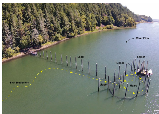
Figure 2. The experimental fish trap in the Columbia River (river kilometer 67) consisted of a lead, jigger, heart, tunnel, and spiller.